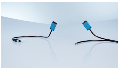
Different connection options to suit your needs