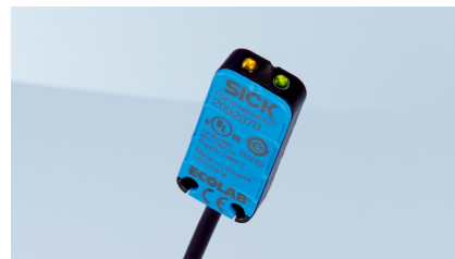
LED display simplifies commissioning