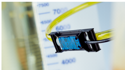
Various mounting options: pipe mounting

sensor to be replaced without changing the mounting device. In most applications, the sensor is plug and play connectable and immediately ready for use. For demanding applications, the sensor can be taught-in via a cable. The status of the voltage supply and output function are indicated by means of two LEDs, thereby ensuring quick commissioning.