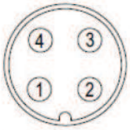
View from front