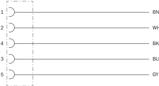
Contact assignment of the M12 female connector