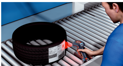
Detection of tires in factory automation: high precision thanks to enclosure rating IP65/67 and rugged housing