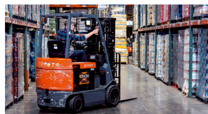
Use in high-bay warehouses and marshaling yards: effective reading of bar codes on pallets or stacked containers