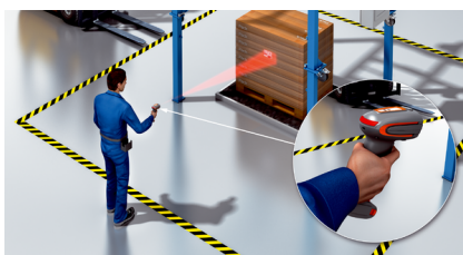
Universal code reading in logistics automation: reliable detection of codes from a variety of distances thanks to large read range