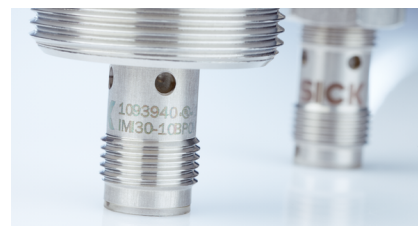
Clearly visible laser marking in the long-term