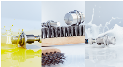
Cleaning with brushes possible