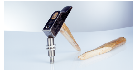
Resistant to mechanical loads, such as shocks