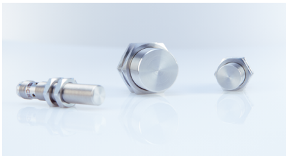
Closed stainless-steel housing

The housing including sensing face of the IMI inductive proximity sensors consists completely of high-strength stainless steel and the sensors have protection class IP68 or IP69K. The stable, leak-free sensors are an extremely rugged solution for challenging applications. This reduces downtimes and ensures very long service life.