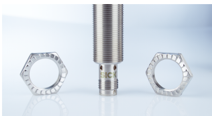
Self-locking stainless steel nuts are included with delivery for this purpose