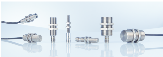
Transparency down to the lowest field level