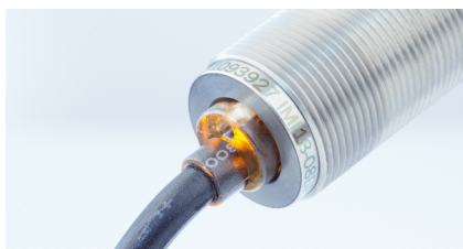
Visual adjustment indicator: The LED signalizes when the secured sensing range has been reached

The IMI can be installed quickly and easily, saving you valuable time. The supplied self-locking nuts facilitate mounting and ensure the sensors stay permanently attached. The IMI is equipped with a so-called visual adjustment indicator: The LED status change from flashing to steadily lit LED signalizes when the secured sensing range has been reached. This ensures the target object is detected throughout the entire temperature range. The unique and systematic type designation is affixed to the sensor so that it remains clearly visible.