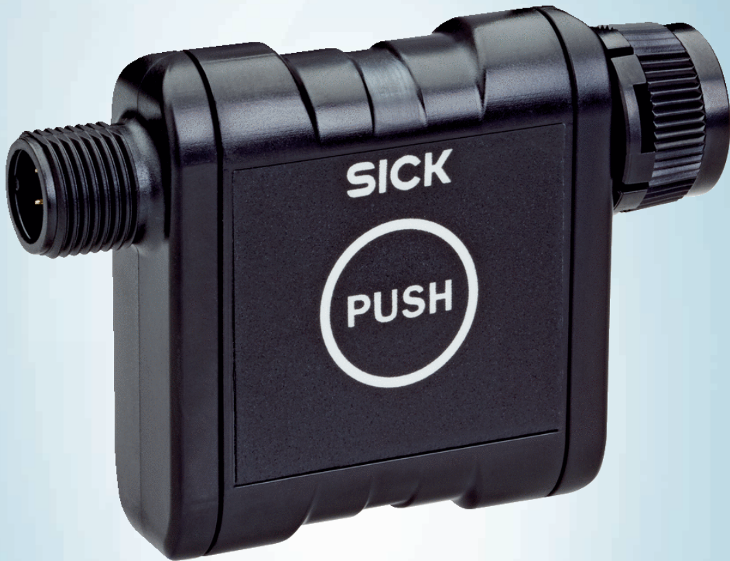
Pushbutton for laser alignment aid, M12, 8-pin