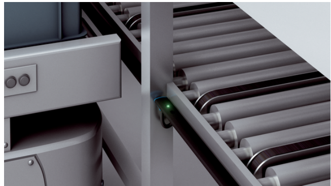
Precise leading edge detection and object overhang detection to decrease conveyor jams and increase efficiency